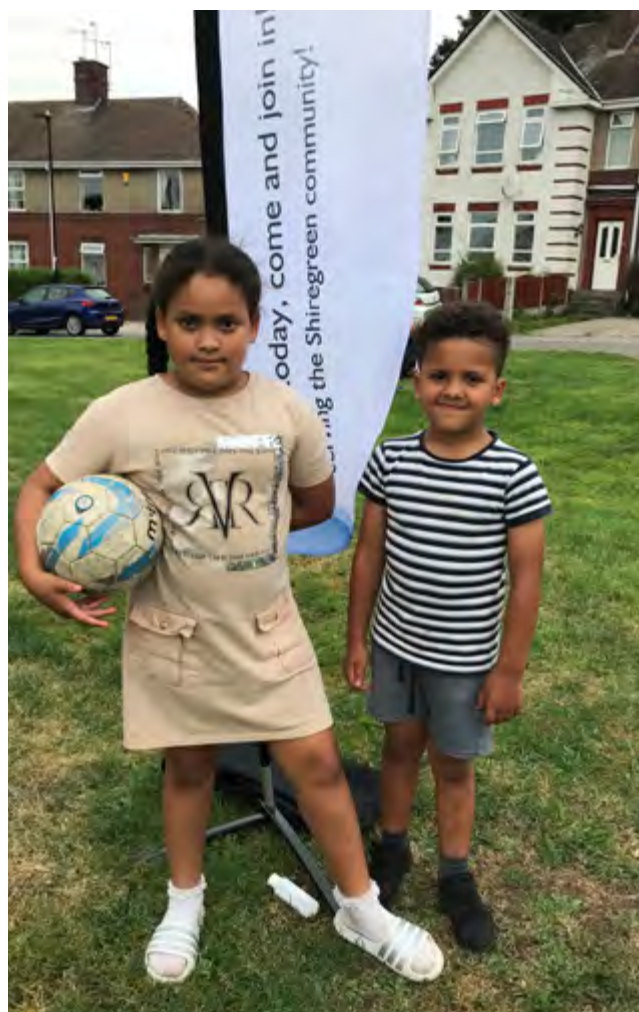
Shiregreen fitness project

► The people that we house and support, our customers, are the reason that we do everything that we do as a business. Our investment in communities is an enduring commitment to helping our customers and communities to thrive. We believe in helping people to have a sense of belonging, to feel connected to and part of their community.