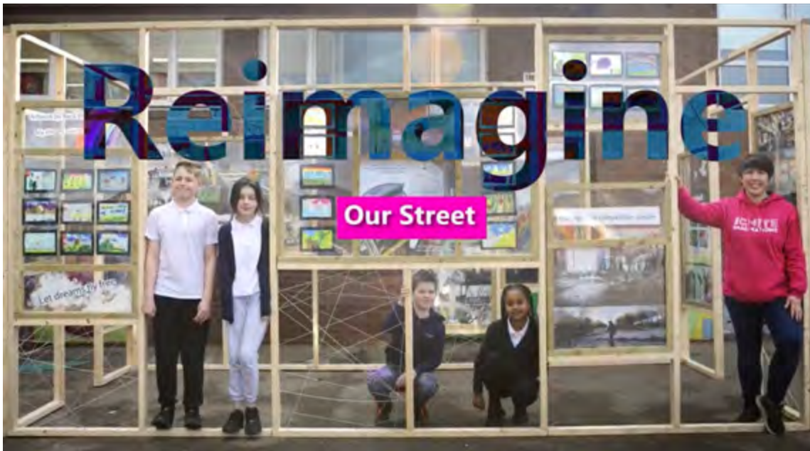
← Ignite Imaginations Reimagine project, Sheffield