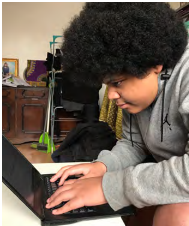
Gascoyne digital project

“Nothing about us, without us, is for us”