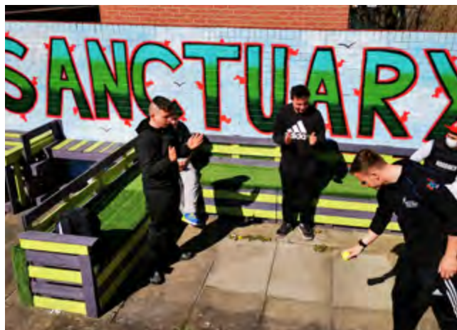
^ Get on Track initiative in Hartlepool with Dame Kelly Holmes Trust