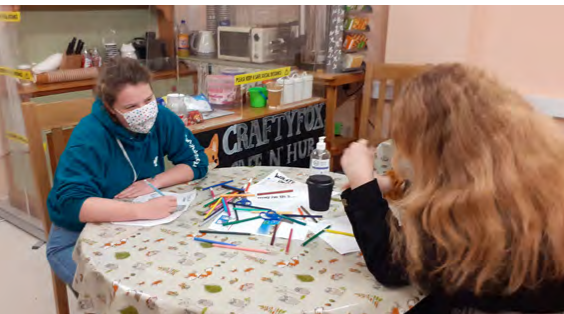
◀ Crafty Fox café and community hub, Paignton

The Crafty Fox have many stories to tell which can be found at - https://www.facebook.com/craftyfoxcafe