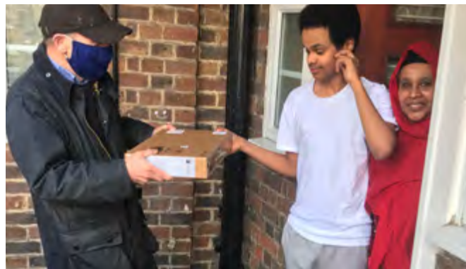
Gascoyne digital project, Hackney