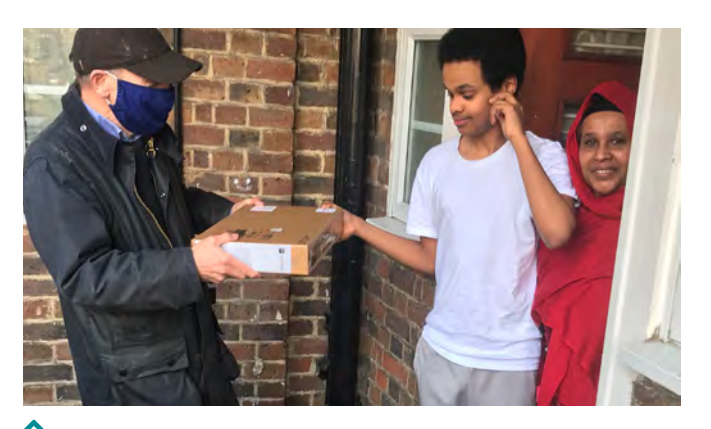
Gascoyne digital project, Hackney