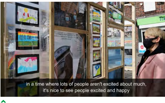
Ignite Imaginations Reimagine project, Sheffield

A video of the project can be viewed here - https://youtu.be/Atu5Z1yJN-A